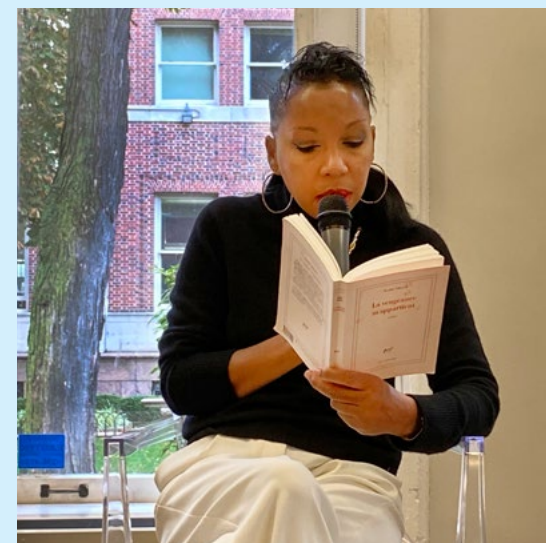
Marie NDiaye reads at the Columbia Maison Française, October 20, 2024