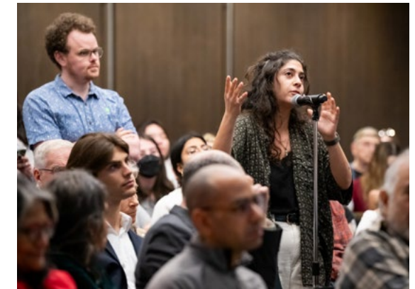
Top: Opening of Mohamed Kouaci: Vision(s) of Algeria photography exhibition

Bigger Than Us by Flore Vasseur (2022) and Q&A with Flore Vasseur and Francesco Fiondella, Oct. 27, 2022.